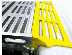
Heavy Duty Load-Bearing Upper Approach Plate