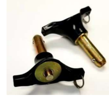
Quick Connect Pins