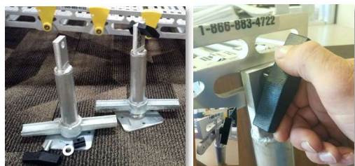
Adjustable Support Stands